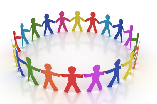
Please help me build my biz! Your trust and referrals are important to me. Keep me in mind when faced with a mental health issue.